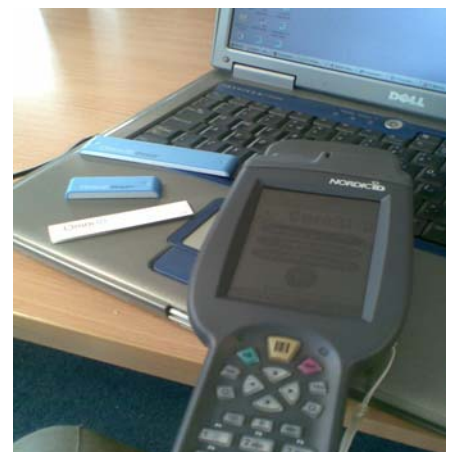
An IT auditor with an RFID equipped PDA can check assets quickly and accurately.

Attaching RFID tags to IT assets means they can be easily tracked and audited. CoreRFID's IT Tracker system is a complete solution to the problems of recording and keeping track of RFID tagged IT assets. CoreRFID provide scanners, tags, readers and a proven software system that can be readily integrated with existing asset registration systems.